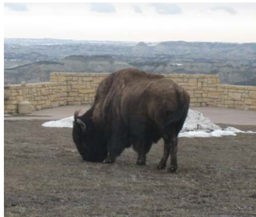
An older bull paying a visit to the Painted Canyon Overlook.

No, both male and female buffaloes have horns.