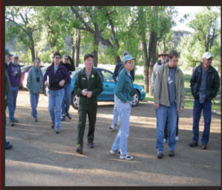
National Park Staff and TRNHA Members participate in the annual birdwalk

The interpretative staff has been working extremely hard to attract members to our association and have done a smash-up job of recruiting new members this past summer.